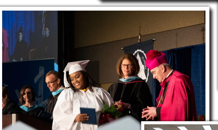
Class of 2018!